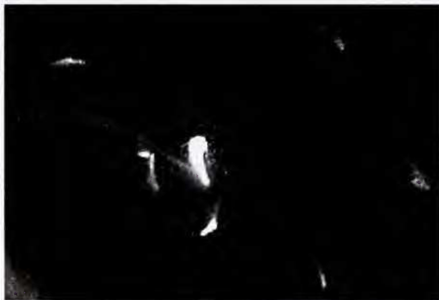
Figure 2. Frame grab from a low-light video recording, showing the glowing arm tips of Vampyroteuthis infernalis . The animal is oriented such that its head and beak are directed toward the camera, with the arms and web beginning to flare outward.

In the laboratory we observed that the tips of all eight arms often glowed when an animal was handled (Fig. 2). The bright blue lights usually appeared as a tight chain of 4 to 6 small discs, tapering in size distally along the oral surface of each arm tip. Occasionally there was a different pattern, in which the light appeared as two parallel lines separated by a dark gap. With a mild contact stimulus, the arms and web flared outward, with the arm tips glowing. With stronger prodding, the arms were curled, writhing up